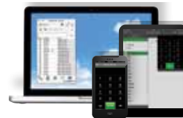
PC and Mobile Softphones