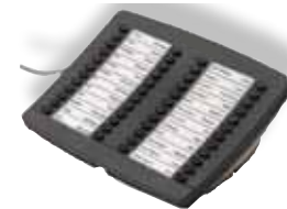
12 & 48 Programmable Key Modules