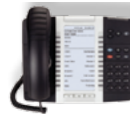
48-Key, 24-Key and 16-Key LCD Phones