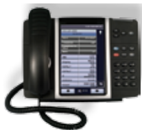
Color Touch Screen LCD Phone