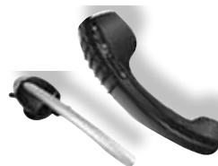
Wireless DECT Headset & Handset